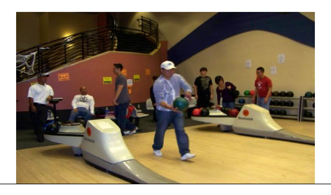
Receive Physical Education High School Credit!